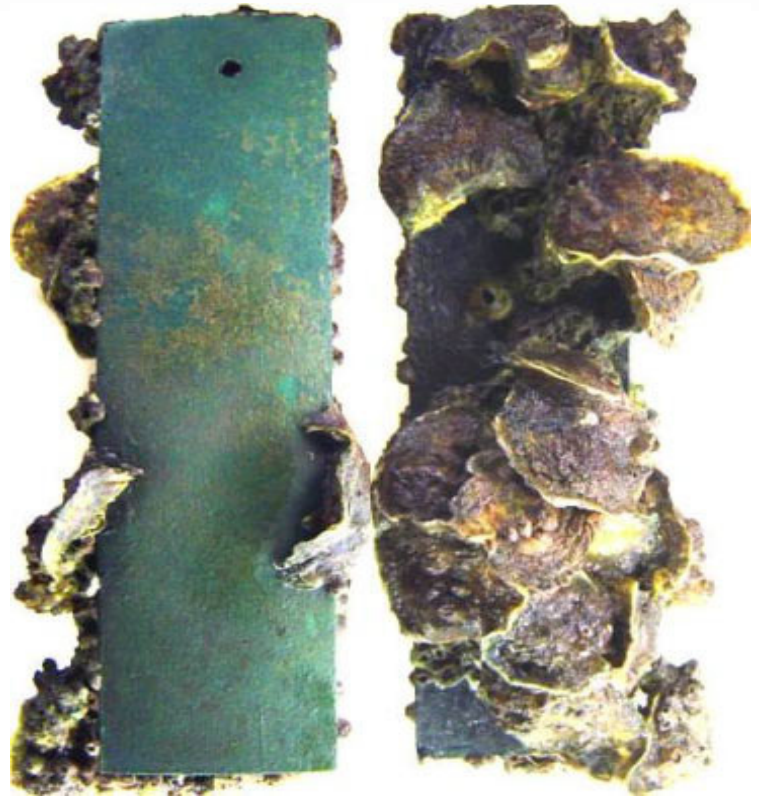
Left - Cuprotect coated side providing complete bio-fouling protection even in most stringent of conditions. Right- Illustrates untreated side of a substrate.

This is due to the low conductivity of the Copper-Nickel granules incorporated into the system, allied with the insulating effect of the primers.