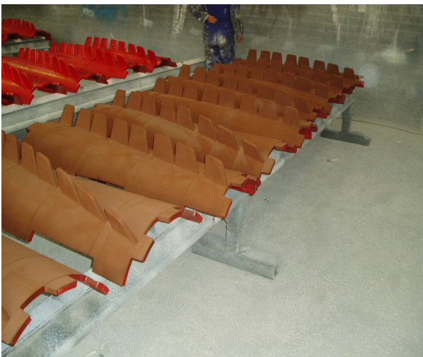
Above Chevron Clamps, Australia Pump inlet strainer, UAE Viv Strakes, Gulf of Mexico